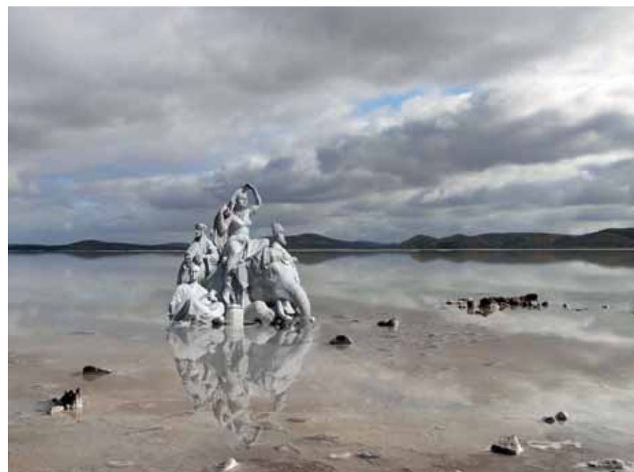
Sue Kneebone, Continental Drift , 2012. Digital montage on acrylic, suite of 3, 35 x 45cm.