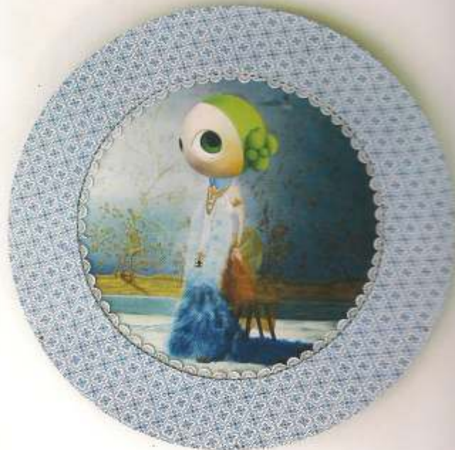
Princess Pea blues

Exercise no- 7, Film, (8'clock; Video; ed. 1/3; 6:02 mins; 2011) that explores aspects of our sensory world through the eyes of Pea's loving agent and loyal friend her dog. The short film presents a dog's eye view of a blissful morning spent with Princess Pea. The dichromatic filter reflects the manner in which dogs see the world and the camera