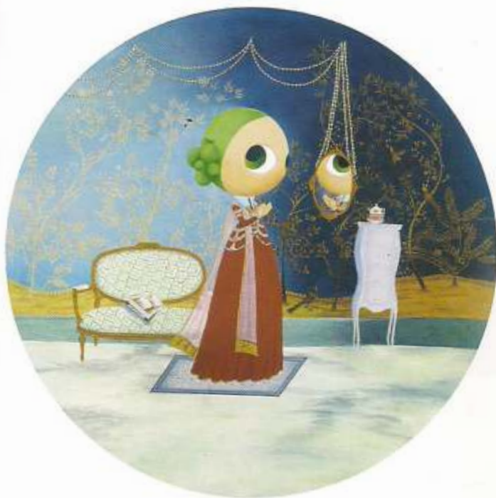
Princess doing sringar in the blue lounge, 2011